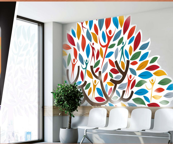
WINDOW AND WALL GRAPHICS