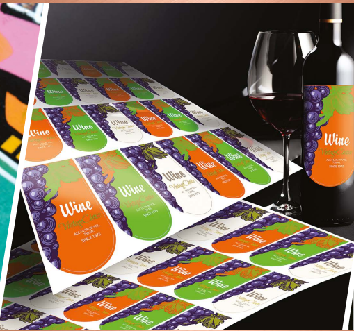
CONTOUR CUT LABELS