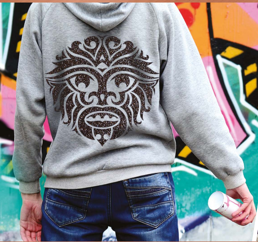
HEAT TRANSFER APPAREL